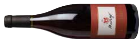
Emanuele Scammacca del Murgo 2014 90 AB 89 MG 92 EOH 89

£15 Roberson A lovely freshness to this 2014 vintage boasting brisk acidity, fleshy cranberry and orange fruit and a touch of iron in the background. Nery and drinkable stuff. Drink 2016-2020 Alc 13%