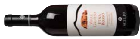
Scilio, Valle Galfina 2014 90 AB 90 MG 89 EOH 90

£31 Fortyfive10, Handford A traditional and respectful style that emanates dusty spices and fresh green herbs on the nose. The palate shows plenty of wild strawberry and black cherry flavours with a hint of butterscotch. Smart winemaking. Drink 2018-2022 Alc 14.5%