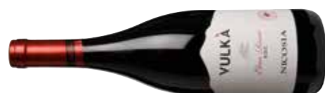
Nicosia, Vulka 2014 90 AB 89 MG 90 EOH 90

N/A UK www.nicosiawines.com A charming nose of bright cherry and plum followed by sweet and ripe wild berries. The palate is exotic and floral with kirsch, mint and cedar notes coming through. A thoughtful wine. Drink 2017-2020 Alc 13.5%