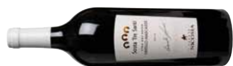
Nicosia, Sosta Tre Santi 2012 90 AB 89 MG 87 EOH 93

N/A UK info@nicolagumina.it Earthy almost truffley nose with dark vermouth notes. A little warm and over-extracted but the juicy fruit enjoys a blast of tannin and tarragon. Maintaining its youth well. Drink 2016-2018 Alc 14%