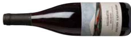
Feudo Cavaliere, Millemetri, 2009 91 AB 89 MG 93 EOH 91

This starts well with intense violets, damsons and bergamot backed up by chocolate and cherry. However it ends up quite lean and green with perhaps a little oxidation. Drink 2016-2017 Alc 13.5%