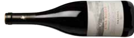
Nicosia, Classic 2013 91 AB 92 MG 91 EOH 90

This wine is quite restrained and tight on the nose and palate, but it is impressive how slowly it is ageing. There is good freshness of cranberry and cherry fruit, and high acidity. Drink 2017-2022 Alc 13%