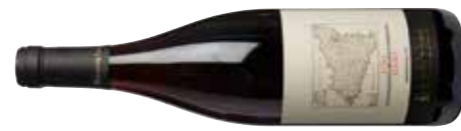
Tenuta Masseria Setteporte 2014 90 AB 94 MG 85 EOH 91

£18.99-£27.99 Amps Fine Wines, Cambridge Wine Merchants, Corks Out, Hennings Wine, Quaff, The Sampler, Vagabond, The Vineking The fruit here is impressive; hardly any signs of age. There are violets and blackberries on the palate on top of tarragon and woodsmoke, followed by some serious tannins. Drink 2018-2023 Alc 14%