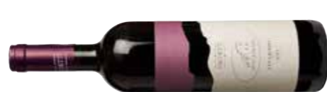
Fischetti, Muscamento 2012 90 AB 89 MG 88 EOH 92

£15 Roberson A lovely freshness to this 2014 vintage boasting brisk acidity, fleshy cranberry and orange fruit and a touch of iron in the background. Nery and drinkable stuff. Drink 2016-2020 Alc 13%