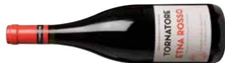
Tornatore 2014 90 AB 90 MG 90 EOH 91

£15 Roberson Wine, Vin Cognito Fresh, lifted nose of cranberry and tobacco leading onto a palate exploding with pomegranate juice, mint and chocolate. Finely grained tannins line the finish, with a touch of green at the back. Drink 2018-2025 Alc 13.5%