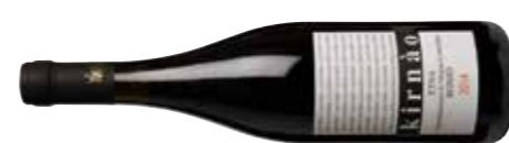
Vino Nibali, Kirnao 2014 90 AB 88 MG 92 EOH 90

£25 Bibendum PLB Dusty, dried spice notes on the nose with smoky and savoury undertones. This follows on to a palate of leather and tobacco along with lots of redcurrant and strawberry. Drink 2018-2022 Alc 14%