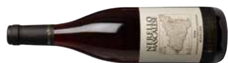
Tenuta Masseria Setteporte, Nerello Mascalese 2013 90 AB 91 MG 92 EOH 88

£25 Vindependents Wonderful aromatics here: full of violets and cranberries, if a little reductive. The fruit is exotic and poised with strong cassis notes. The alcohol is certainly high, but this is commercially attractive. Drink 2017-2020 Alc 14.5%