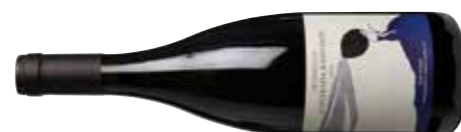
Pietradolce, Contrada Rampante 2014 90 AB 91 MG 88 EOH 92

£26 Armit Wines Lifted, attractive, high-toned notes of cranberry, sweet cherry and liquorice leading onto a shy and tight palate that is simple yet bright with hints of mocha and tobacco. Drink 2017-2022 Alc 13%