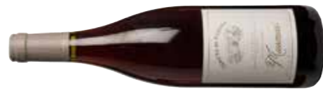
Tenuta di Fessina, Il Musmeci 2011 90 AB 89 MG 92 EOH 90

£27.99 Vindependents Smoky notes dominate on the nose, along with a lovely scent of old books, leather and game coming through. Lots of ripe, almost jammy, blackcurrant fruit flavours but also a strong mineral core. Drink 2017-2019 Alc 14%