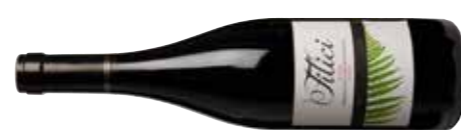
Nicola Gumina, Filici 2012 90 AB 91 MG 89 EOH 90

N/A UK www.fischettiwine.it Chalky blue fruit aromas with some charred notes plus wet leather and cigar box. Pleasing stony, nutty, mushroom flavours that are mouthfilling, but the finish is a little bitter and aggressive. Drink 2016-2018 Alc 15%